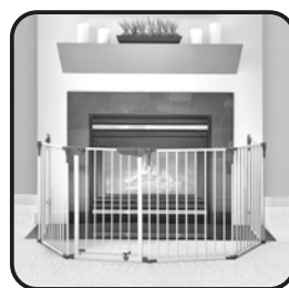
Assembled Fireplace Guard