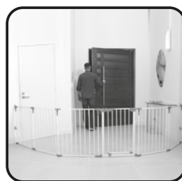
Assembled Barrier Gate

Slide the release switch (H) and lift gate panel (A).