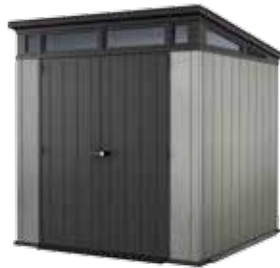
ARTISAN 7x7 214Wx218Dx226H cm