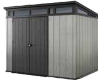
ARTISAN 9x7 277Wx218Dx226H cm